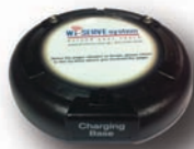
Round Charging Base