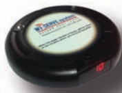
Digital Coaster Pager