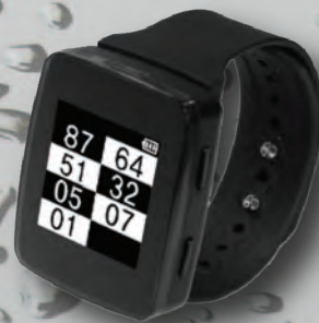
Table Call Watch Receiver (LM-D800L)

Wi-SERVE system extend your reach www.foodicon.com.sg | (65) 6782 4629