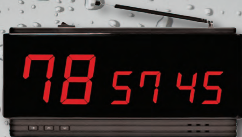
Table Call Display Receiver (LM-D302KF)