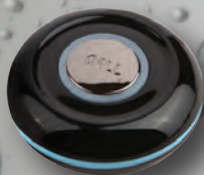
Table Call Single Button Waterproof Transmitter (LM-T9000F)