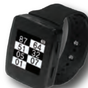
Table Call Watch Receiver (LM-D800L)