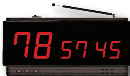
Table Call Display Receiver (LM-D302KF)